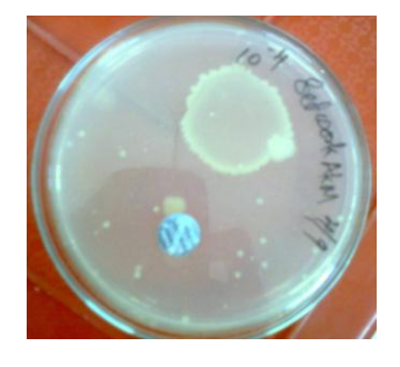
Figure 1:Earthworm gut isolates on nutrient agar